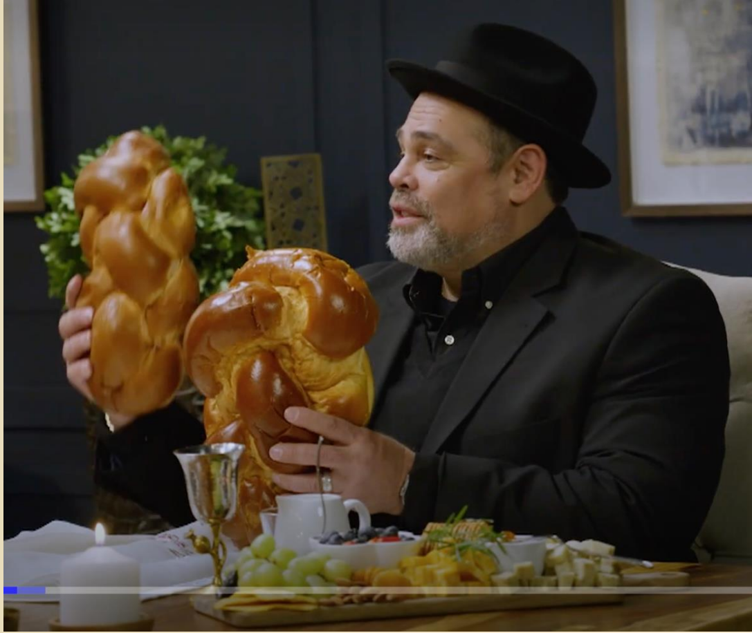
The Fullness of the Harvest