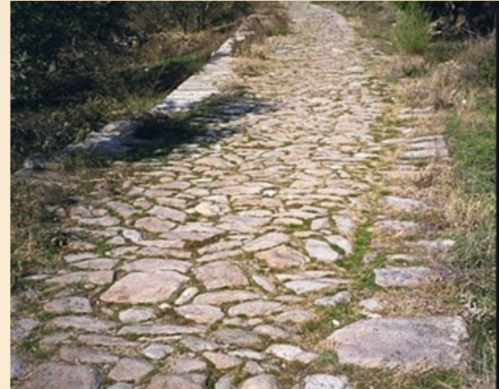
Via Egnatia – Rome to Bithinia Main Street of Thessalonika