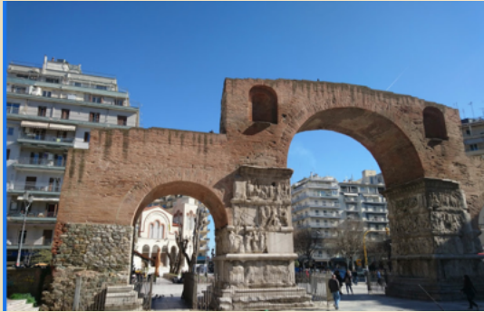
Arch of Gaius