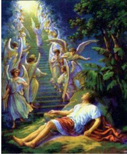
Jacob's Ladder (Publisher of Bible Card/Wikimedia Commons)

image: https://www.breakingisraelnews.com/wp-content/uploads/2017/01/JacobsLadder-247x300.jpg