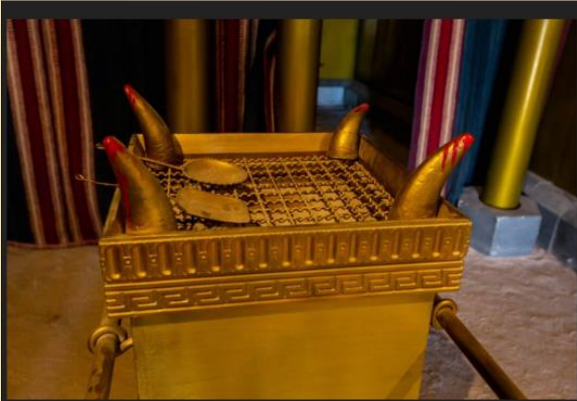
Picture of the Altar of Incense in Jerusalem replica of the temple