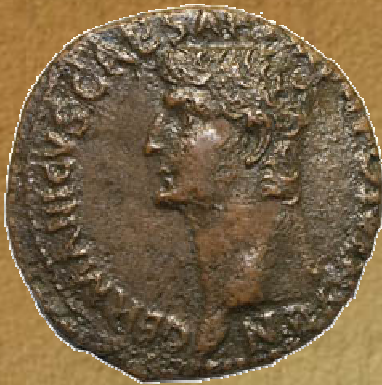
Coin with image of Emperor Claudius